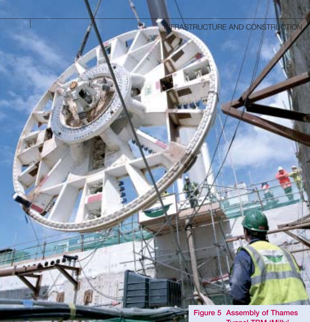
Figure 5 Assembly of Thames Tunnel TBM 'Milly' – cutting head being lowered into position

largest European gauge, designers have made use of huge tunnel boring machines (TBMs) that look like space capsules turned sideways. Local community groups, such as school children and hospital nurses, have given them such names as Bertha, Annie, and Milly the Muncher Cruncher.