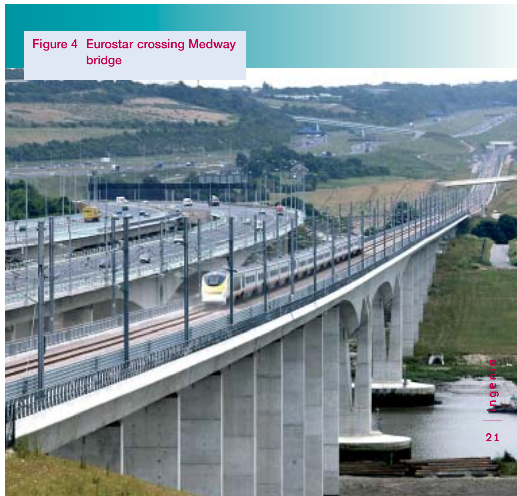
Figure 4 Eurostar crossing Medway bridge

Because a quarter of the CTRL runs underground, tunnelling is a major challenge. To dig tunnels large enough to accommodate trains built to the