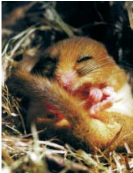
Figure 8 Dormouse, hibernation

The project has also taken pains to protect archeological relics discovered during excavation for the new line. Finds along the route have included an Anglo-Saxon burial ground at Cuxton and a major Roman complex and Anglo-Saxon water mill at Ebbsfleet. At Saltwood in east Kent, the newly discovered grave of an affluent woman in an Anglo-Saxon cemetery was found to contain artifacts of national importance, including a superbly preserved gold and silver brooch studded with garnets and emeralds.