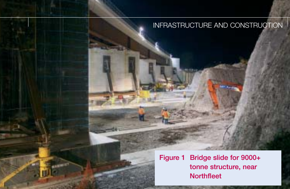
Figure 1 Bridge slide for 9000+ tonne structure, near Northfleet

bridges, 26 km of tunnels (19 km in London alone) and enough excavation to fill Wembley Stadium 12 times. The line will include new international stations at Ebbsfleet in north Kent and Stratford on section 2, as well as reconstruction of the Ashford International station on section 1 and the enhancement of St Pancras. The train deck at St Pancras is being extended 250 m to accommodate the 400 m long Eurostars, and Barlow's original Victorian train shed – which once boasted the widest unsupported arch span in the world – is being substantially refurbished, including the restoration of the glazed roof and new facilities in the currently unused undercroft. In addition, three platforms will be created to