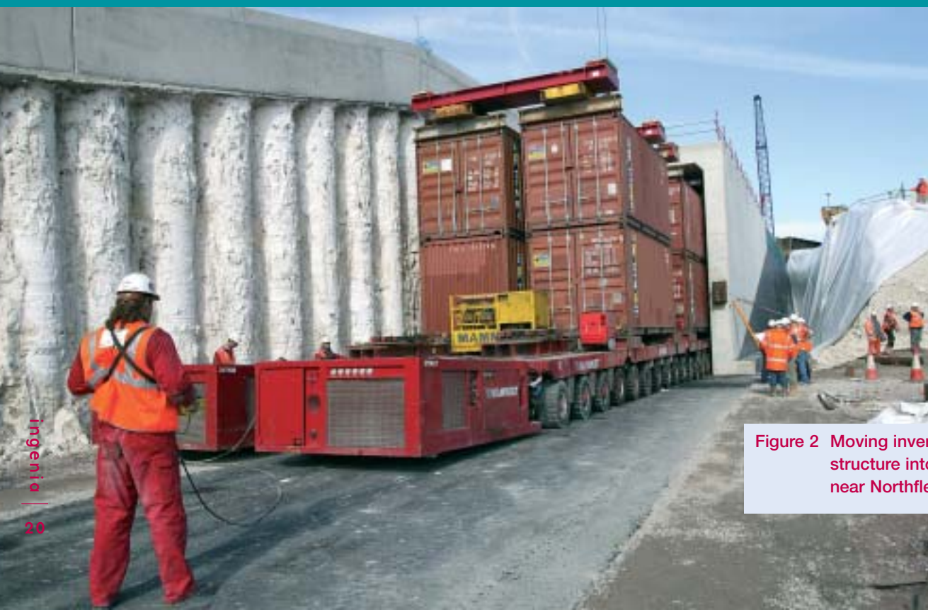
Figure 2 Moving inverted box structure into position, near Northfleet

The 111 m long, three-span, steel and concrete bridge was constructed in a clearing about 50 m from its final destination. With the suspension of rail traffic early on Saturday 3 May, the team began excavating a chalk embankment under the existing railway, creating four openings into which the span's concrete abutments could slide. With the aid of 30 hydraulic jacks, the crew raised the 9000-tonne bridge,