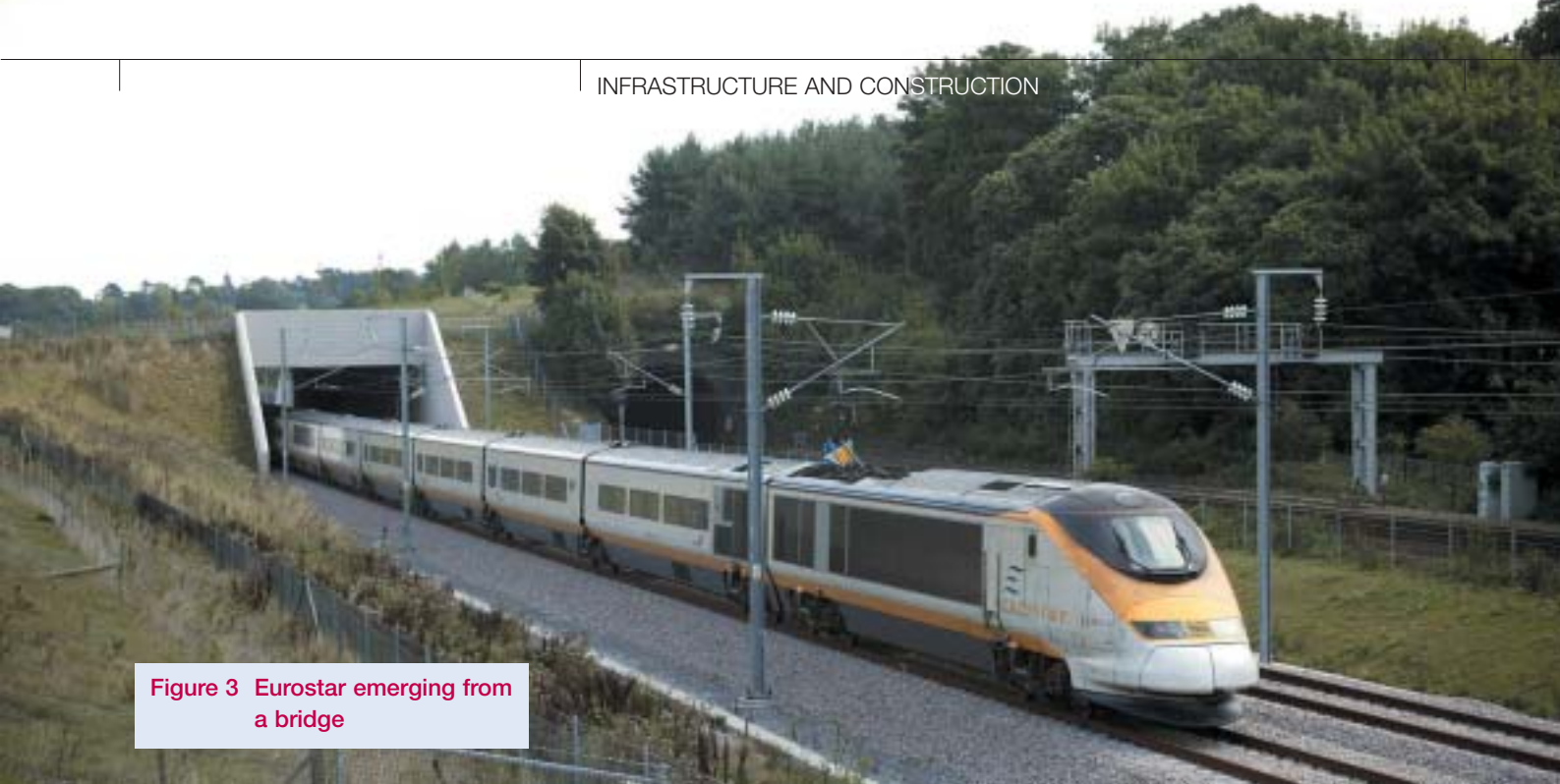
Figure 3 Eurostar emerging from a bridge

then inched it into position in a six-hour operation early on 4 May. During the installation, the bridge's movement was constantly monitored to keep it within a tolerance of 8 mm.