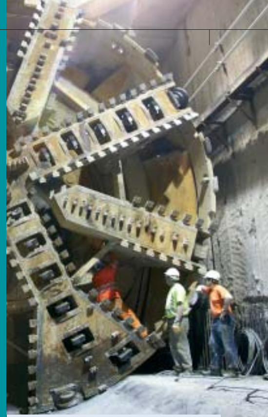
Figure 6 TBM 'Annie' at the Graham Road ventilation shaft, London

Project workers are marking expensive equipment with SmartWater Instant, a clear, water-based solution containing microscopic particles encoded with the owner's information. The SmartWater is invisible to the naked eye, but it shows up under