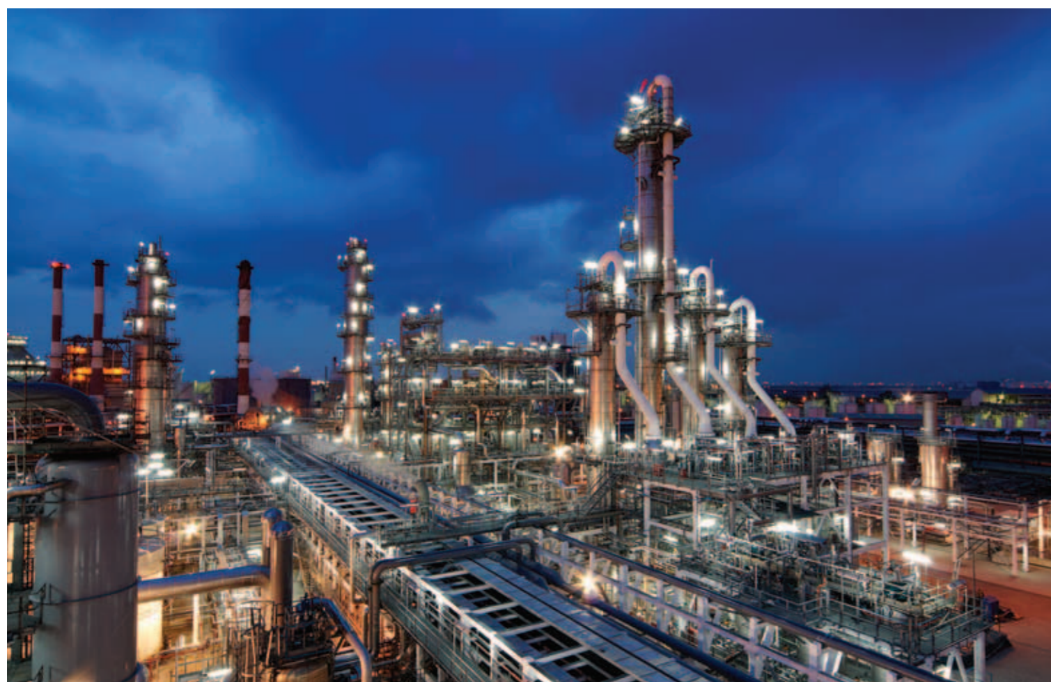
Alpha 1 plant, Jurong Island Singapore. This is the first-in-class plant using Lucite's Alpha technology. It was commissioned in the latter part of 2008 and cost $230 million to engineer and construct

UK, starting with preliminary catalyst trials and conceptual process design studies that began in 1990.