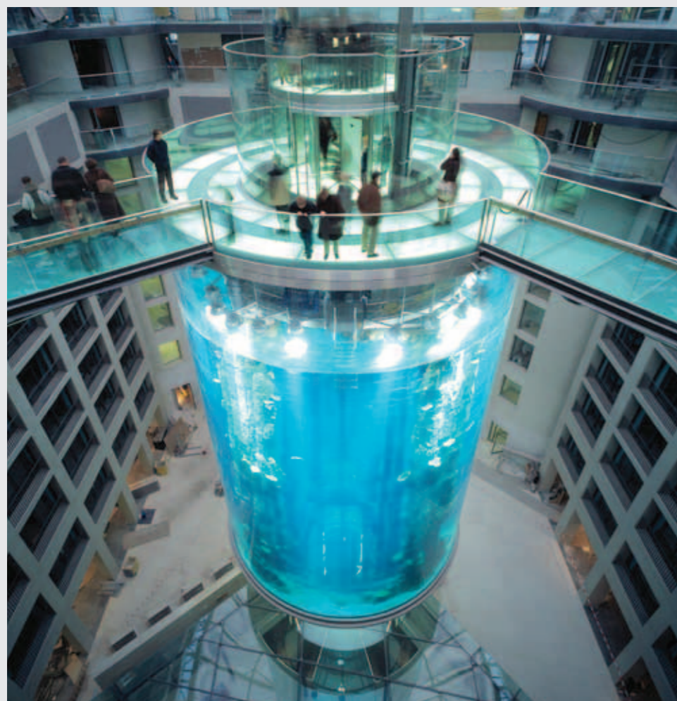
MMA was the raw material for this ground-breaking aquarium, which forms the centrepiece of Berlin's DomAquaree hotel and leisure complex. Suspended 8 m off the ground, the cylindrical aquarium is made from 150 tonnes of high-optical clarity acrylic. A seven-minute narrated elevator ride through the structure allows a good view of more than 2,500 fish swimming in the one million litre artificial seascape

One of the biggest growth sectors for Lucite's SpMAs is in surface coatings, which include automotive finishes, lubricants, inks and adhesives. Its durability has made it attractive to the surface coatings industry, as has worldwide environmental legislation which is driving the increased use of waterborne coatings with low solvency ratings.