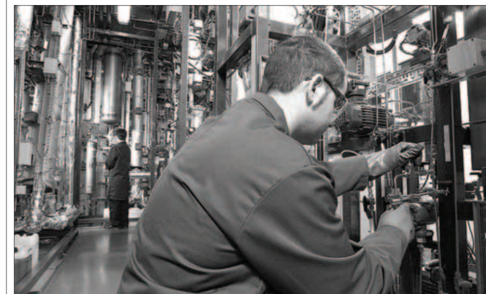
Lucite International's Alpha pilot plant is located at Wilton, UK. It fully reproduces the plant that was commercialised in Singapore in 2008 but at 1/25,000th of that scale. It is manned by two operators and one analyst 24 hours a day, 330 days a year. Lucite continue to run the pilot plant to test improved catalysts and process enhancements and to develop the next generation of MMA technology based on the Alpha chemistry

This enables a strategy for process operation to be developed that takes into account how changing conditions in one part of the plant affect operations elsewhere. Such a strategy is critical to the building of a comprehensive process model that provides the basis for the successful scale-up to commercial plant size.